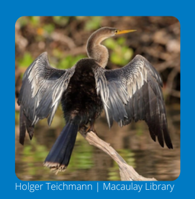
Anhinga Anhinga anhinga

Anhingas are sometimes referred to as the "water turkey" for its turkeylike tail or "snake bird" for its snakeshaped neck. You may spot the Anhinga with its wings outstretched and head held up as they are drying their waterlogged feathers.